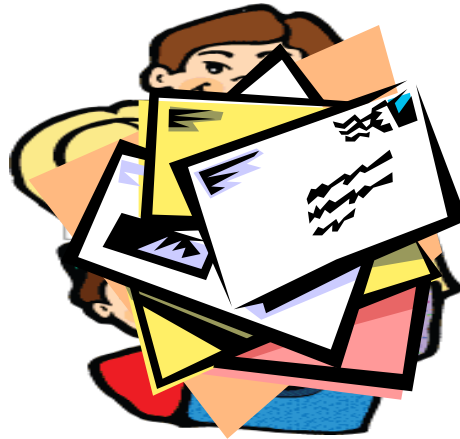
Help Us to Keep Working for Our Communities

the school will provide regular, two-way, meaningful communication between family members and school staff.