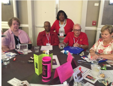
OEA-R at the June 29-30 NEA-R Annual Meeting in Washington, DC.

The NEA C4O (Center for Organizing) has a campaign vision to address the three Priorities on data collection pieces. 2,000,000 new educators will be hired in the next 5 years and they leave the profession for several reasons.